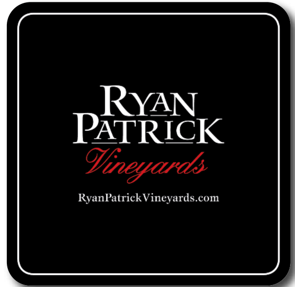
Image of coaster is not actual size.

Call us toll-free at 1.877.423.2627 or order online at www.adcoasters.com/order.html